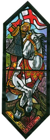
Stained glass window of St. George in the entry hall of the church